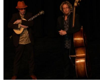
One the acts entertaining guests for the opening "The Polyjesters"